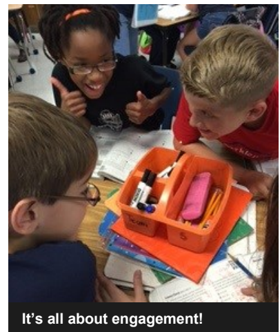
It's all about engagement!

There are many well documented and researched academic, psychological, and social benefits to using Kagan Cooperative Learning. Using the structures regularly drastically reduces negative behavior. Students are taught how to positively interact with each other through cooperative learning and are taught to offer their partner/group praise when they get an answer right.