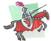
Berkley Charter School